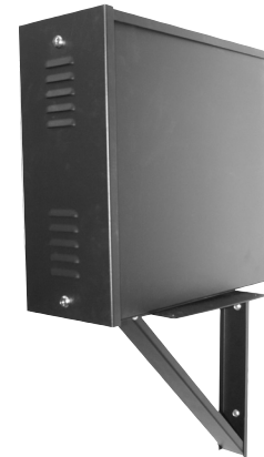
Shown with a Tower Model Mier DVR/CPU Lockbox (sold separately)