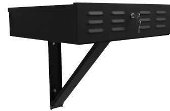
Shown with a Standard Model Mier DVR Lockbox (sold separately)