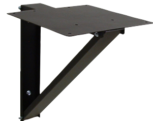
BW-215 Wall-Mount Kit